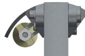
Offset Miniature Turbine Spinner