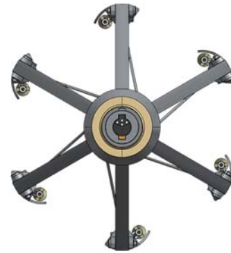
Two Electrode Capacitance